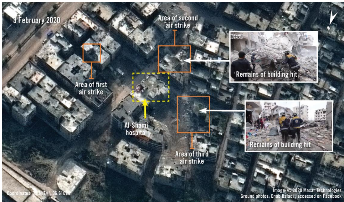
Satellite imagery taken on 3 February 2020 showing al-Shami hospital and its environs after the three air strikes that took place on 29 January 2020. Damage to adjacent buildings is visible in the orange squares. The inset photographs, taken on 30 January 2020, show civil defence volunteers inspecting the remains of the building hit in the second and third air strike.