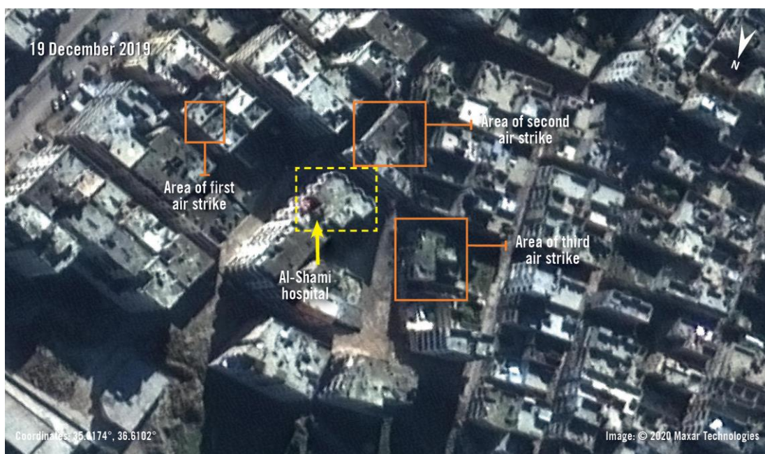
Satellite imagery taken on 19 December 2019 showing al-Shami hospital and its environs before the three air strikes that took place on 29 January 2020.

Al-Shami hospital closed after the attack due to the damage to equipment in it and the advance of government forces into Ariha.