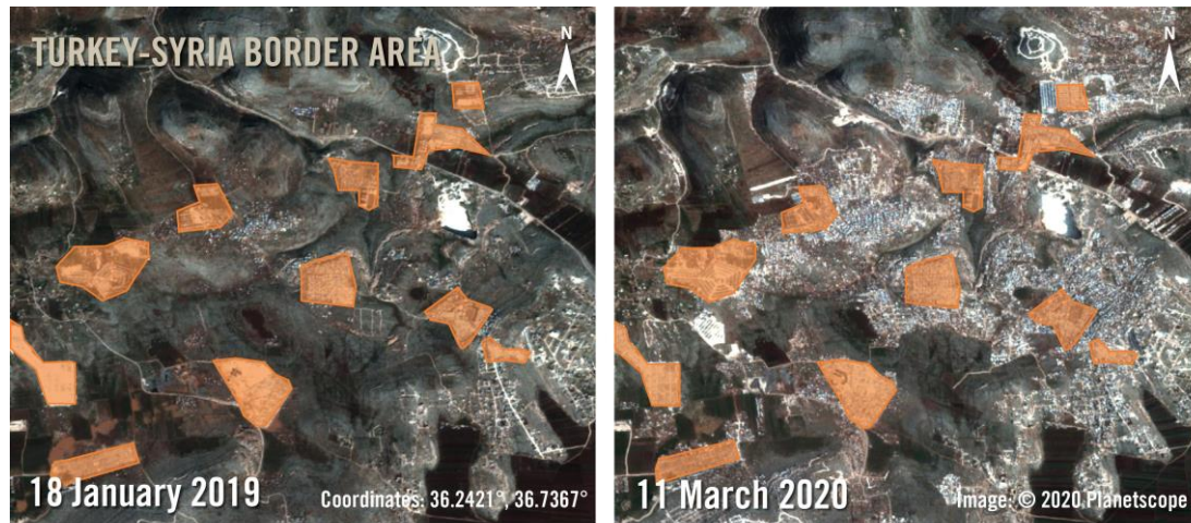
Satellite imagery from 18 January 2019 (on the left) shows 11 established camps – highlighted in orange – less than 5km east of the border with Turkey in Idlib, Syria. Satellite imagery from 11 March 2020 (on the right) demonstrates that the number of structures in the area around the 11 camps had expanded greatly during the 14 intervening months.

forces. Furthermore, these same forces failed to prevent displacement by carrying out indiscriminate attacks that terrorized the population. 84